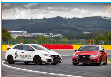
Le Circuit de Spa-Francorchamps

Route Du Circuit 55 Francorchamps - 4970