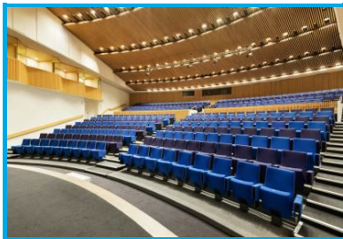
Hôtel Dolce La Hulpe Brussels