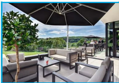
R hotel experiences

Square Philippe Gilbert 1 Remouchamps - 4920